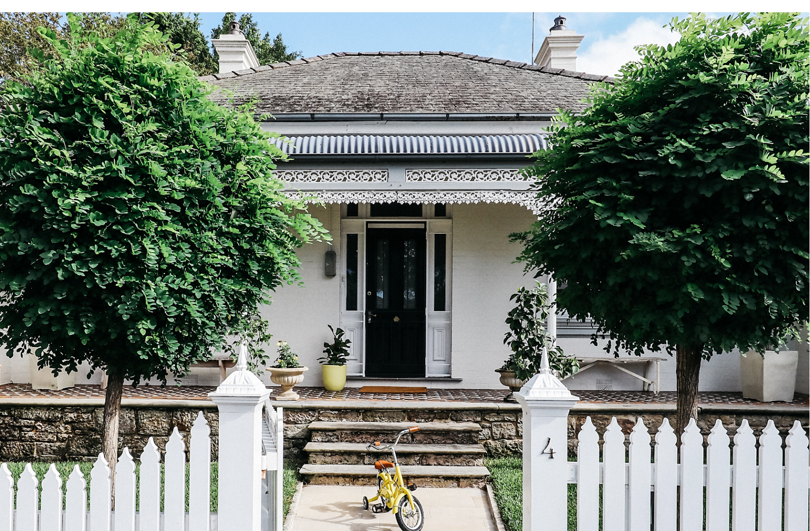
One Bedroom (Harbour view) - Collett's Corner, Lyttelton $380 - $400 20th April 2021

Ray White Morris & Co Property Management thanks you for engaging us to conduct a rental appraisal on your property. Based on the current market and comparable properties in the area, we would consider the current market value to be approximately $380-$400 per week.